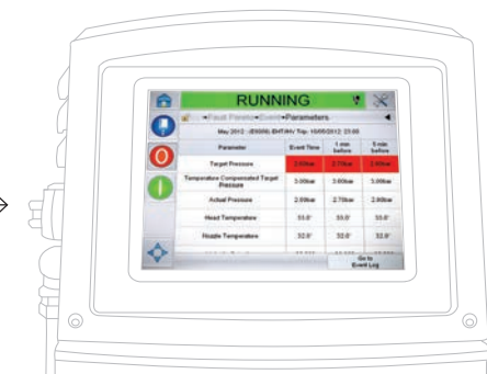
Diagnose root cause, make process improvements