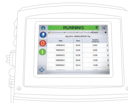
Review frequency and duration