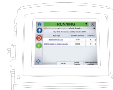
See the biggest drivers of downtime

Our CLARITY™ interface gives you instant fault information that you can use to troubleshoot problems and get your line back up and running ASAP.